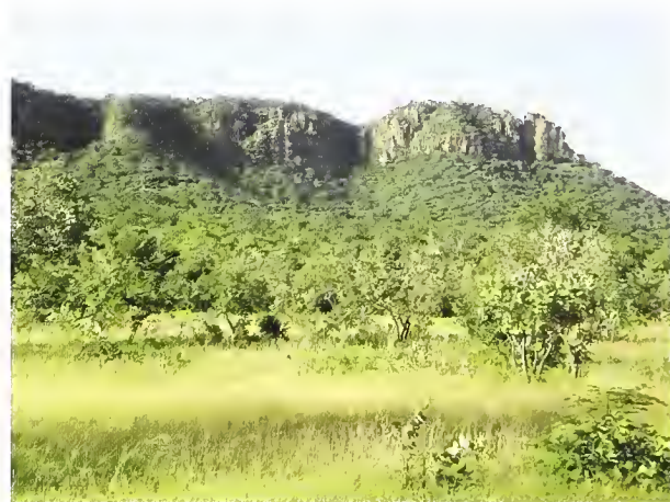
Figure 2. Savannah with patches of grass and shrubs, semi-deciduous forest on the foothills and rocky cliffs, during the wet season, Dindéfello Nature Reserve, Senegal, September 2011

Local topographic factors influence the structure and composition of the habitats, approaching in some cases the forest-mosaic type (semi-deciduous forests, gallery forests in ravines and drainages) and the more seasonal Sudan savannah in others (grassland with woodland patches interspersed in boue or lateritic soils; see Figs. 2–4). The semi-deciduous forest covering